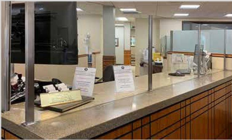
City of Laguna Niguel, CA City Hall - Customer Service & Office Areas

Manufacturing custom quality sneeze guards and protective barriers, adapting customer experience in the time of Coronavirus has never been more essential for businesses of all kinds. Our guards provide another layer of protection with a interaction window for employers, workers & customers against coughing & sneezing. And also may, reduce exposure to health hazards in the workspace.