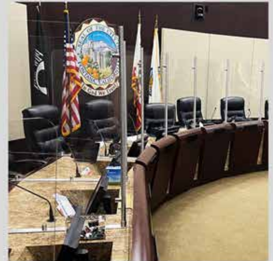
City of Fontana, CA Council Chambers & Development Services