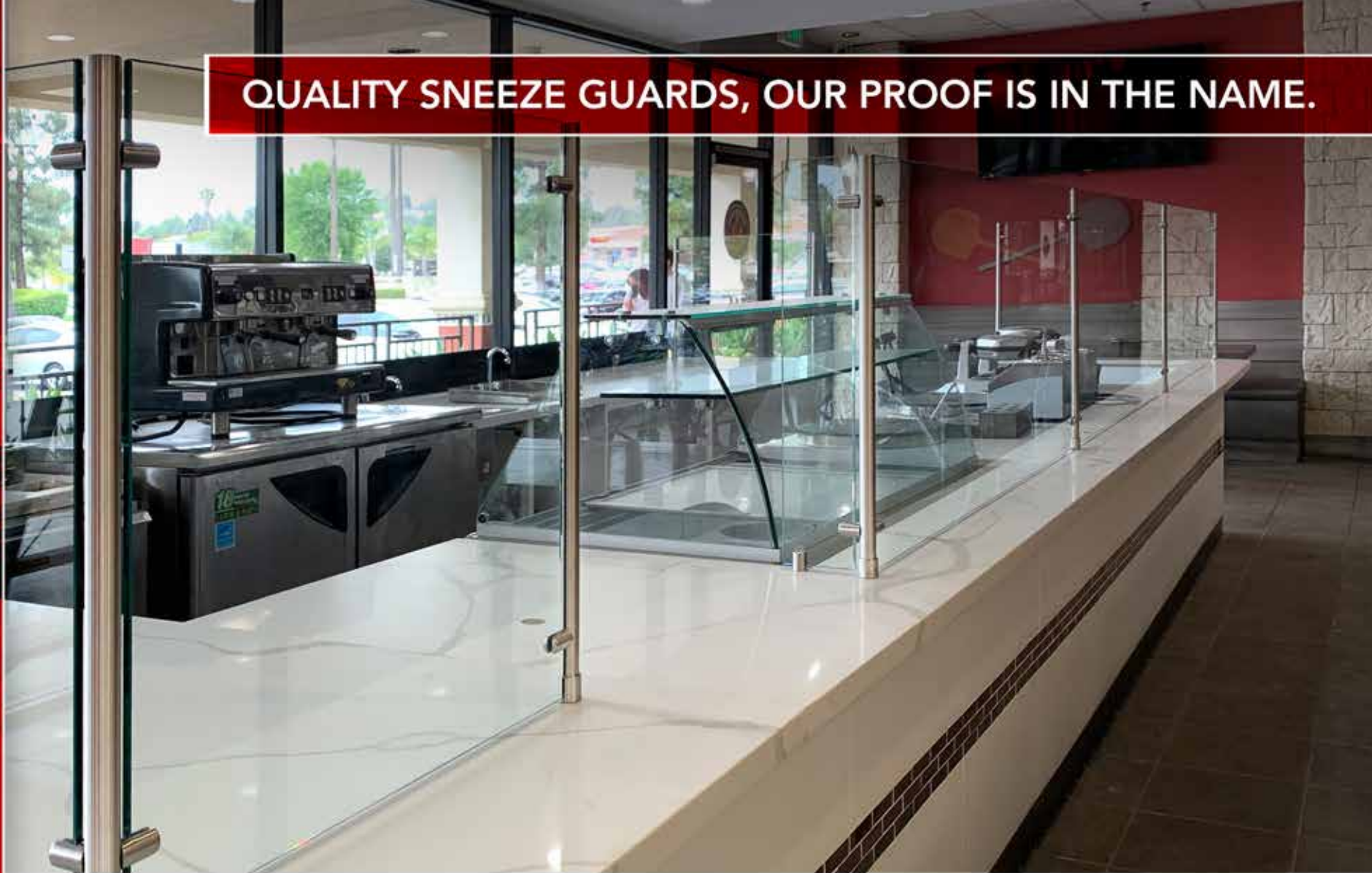
Wood Stone Pizza, Chino Hills South Coast Developers, Inc. Protective Barrier w/ Conceal Mounts

QUALITY SNEEZE GUARDS, OUR PROOF IS IN THE NAME.