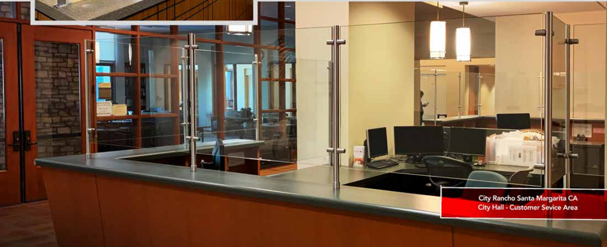
City Rancho Santa Margarita CA City Hall - Customer Service Area